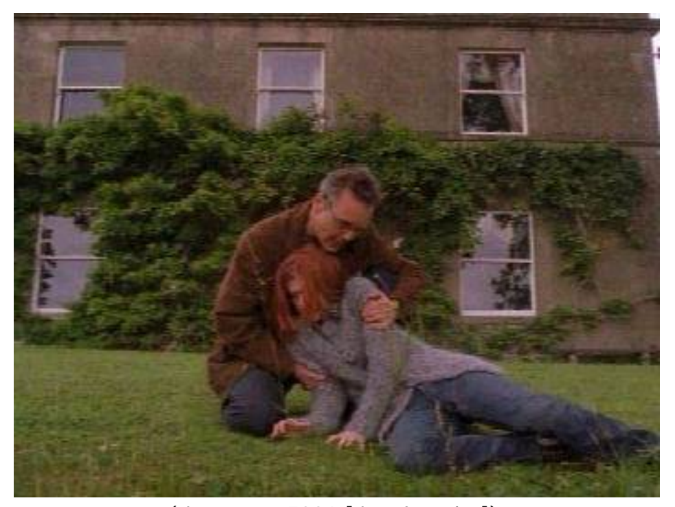
("Lessons," 7001 [Just Imagine])

Notice that Willow's terrified position in this scene: