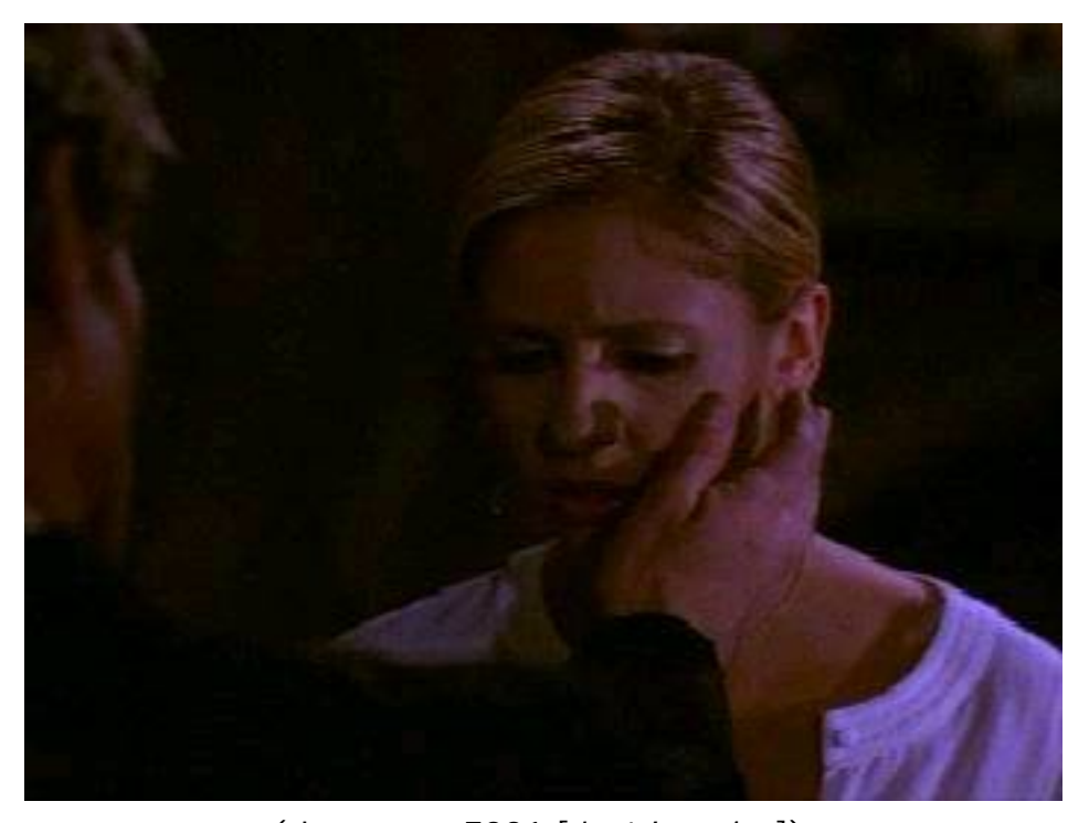
("Lessons," 7001 [Just Imagine])

[15] Perhaps the most significant representation of connection in "Lessons" is one that is easy to miss, but can be followed through succeeding episodes until it comes full circle to return to its origin. Buffy, having fought her way through the "manifest spirits" to get to a room in the high school basement where she believes she'll find Dawn, prepares to kick open the door only to be confronted by a disheveled Spike, clearly the last person she expected. "Buffy," he says blankly, reaching out to touch her cheek, "duck—" (7001). James Marsters, as Spike, keeps the intonation perfectly neutral, so that the viewer and the startled Buffy are momentarily suspended among three possible interpretations—the British endearment, a warning to "duck!" or Buffy's stunned "What? Duck? There's a duck?"—before she is bashed by a the spirit-janitor. It's a beautiful moment of verbal play, but the real key is the ever-so-brief gesture of physical connection: