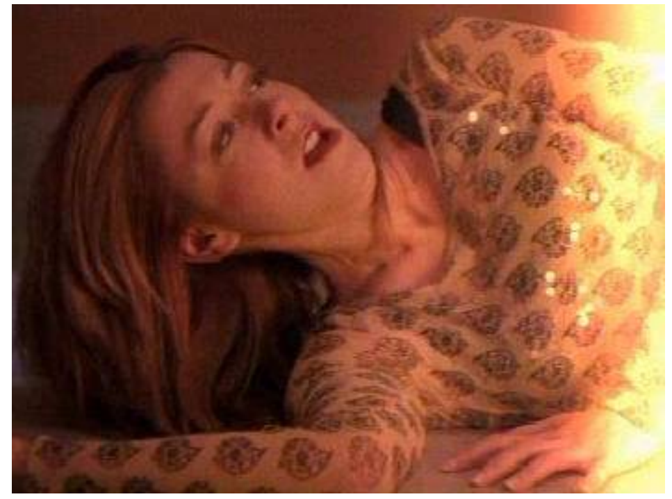
("Chosen," 7022 [Just Imagine])

and the earth does not swallow them all, though there are certainly great losses.