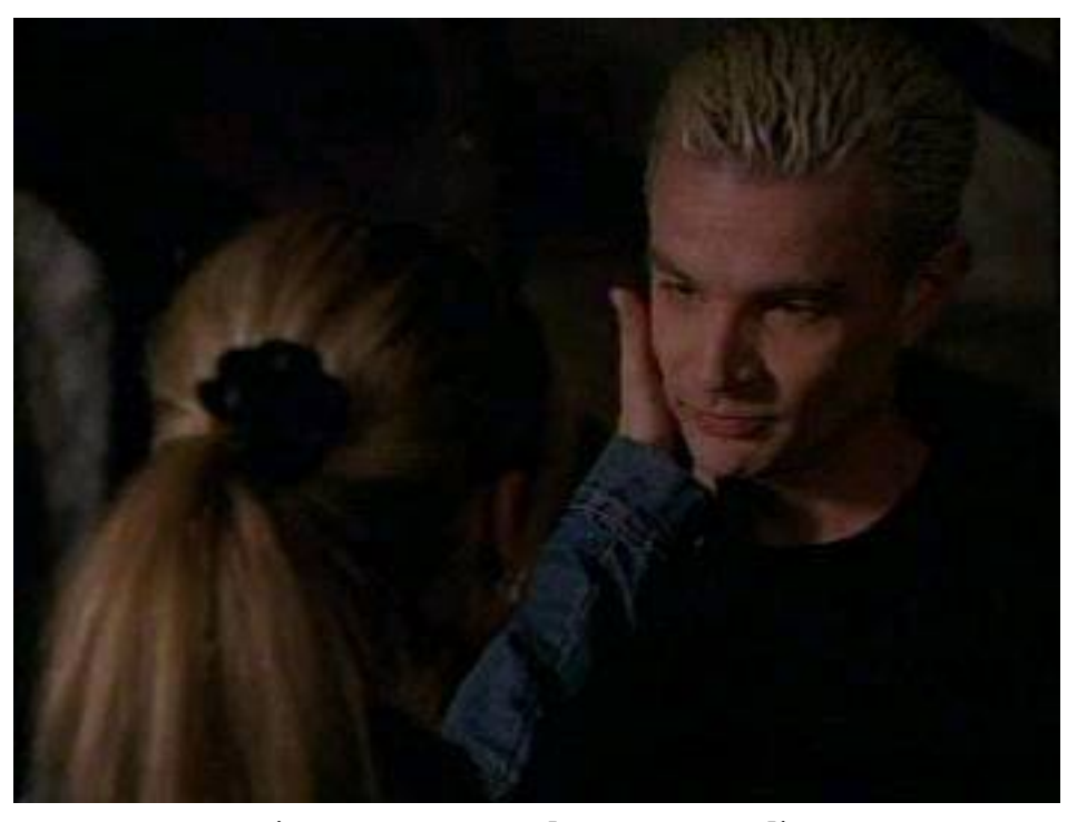
("Chosen," 7022 [Just Imagine])

Joyce's appearance in Buffy's dreams representing both the memory of her mother's love and Buffy's own "mother wit," telling her what she knows instinctively, although she's not ready to accept it yet (7010). In "Get It Done," the shaman gives Buffy the knowledge she asks for with the same simple touch after she rejects his attempt to fill her with additional demonic "slayer power" (7015); in "Touched" (7020), Spike, now in full possession of his faculties, touches Buffy's face again, saying "Hey, look at me"—a variation on "You can't just watch, you have to see" ("Get It Done," 7015). In the same episode, Faith connects with Robin Wood with a variation on the same gesture, taking his hand and bringing it to her face: "FAITH: Been awhile. Am I out of line? PRINCIPAL WOOD: Hey, you're the leader" (7020). And finally in "Chosen," Buffy brings the circle of connection back around to Spike, as she reaches out to him after giving him the champion's amulet, not going up the stairs as she did in "The Gift," when she was still, indeed, "unattainable" and he was a "monster" she "treat[ed...] like a man" (5022).