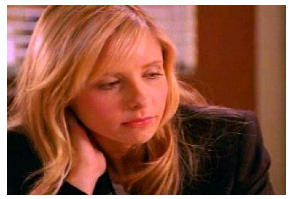
(7010 [Just Imagine])

Joyce's appearance in Buffy's dreams representing both the memory of her mother's love and Buffy's own "mother wit," telling her what she knows instinctively, although she's not ready to accept it yet (7010). In "Get It Done," the shaman gives Buffy the knowledge she asks for with the same simple touch after she rejects his attempt to fill her with additional demonic "slayer power" (7015); in "Touched" (7020), Spike, now in full possession of his faculties, touches Buffy's face again, saying "Hey, look at me"—a variation on "You can't just watch, you have to see" ("Get It Done," 7015). In the same episode, Faith connects with Robin Wood with a variation on the same gesture, taking his hand and bringing it to her face: "FAITH: Been awhile. Am I out of line? PRINCIPAL WOOD: Hey, you're the leader" (7020). And finally in "Chosen," Buffy brings the circle of connection back around to Spike, as she reaches out to him after giving him the champion's amulet, not going up the stairs as she did in "The Gift," when she was still, indeed, "unattainable" and he was a "monster" she "treat[ed...] like a man" (5022).